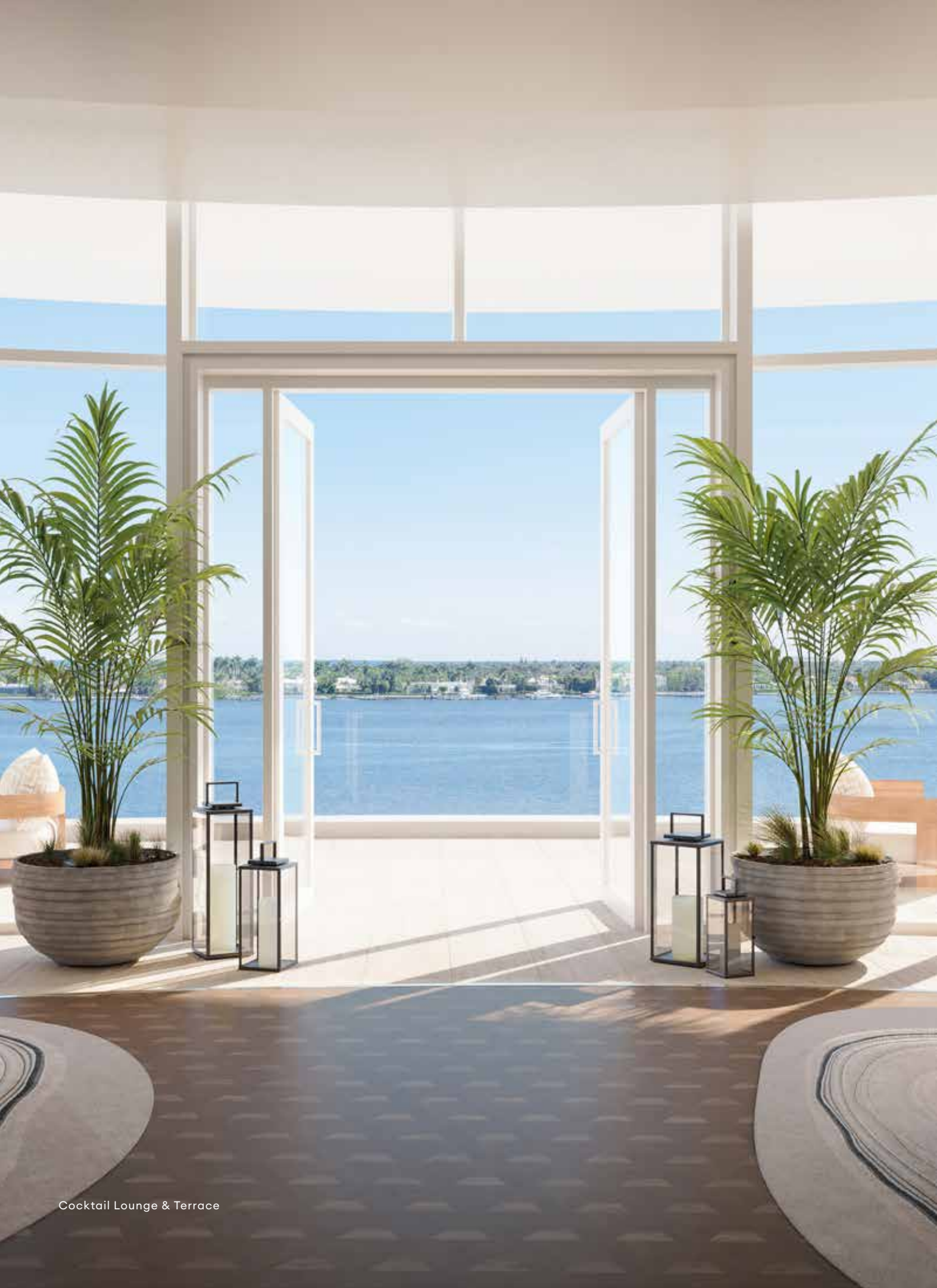
Cocktail Lounge & Terrace