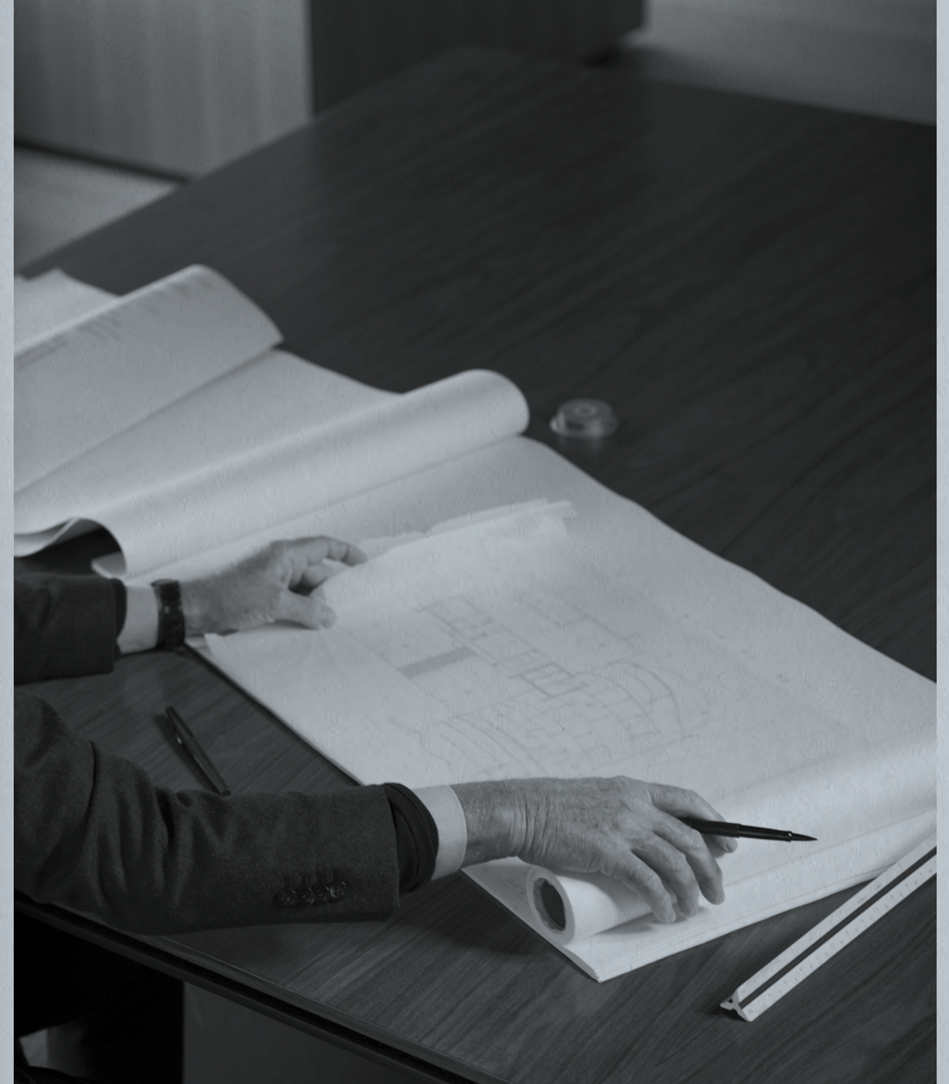
ROGER FERRIS Founding Principal Roger Ferris + Partners

“Shorecrest resides on a spectacular slice of West Palm Beach. The building features a curvilinear façade with intricate mosaic design on the exterior. Inside, floor-to-ceiling windows emphasize panoramic views and large outdoor terraces bring the outdoors into each residence.”